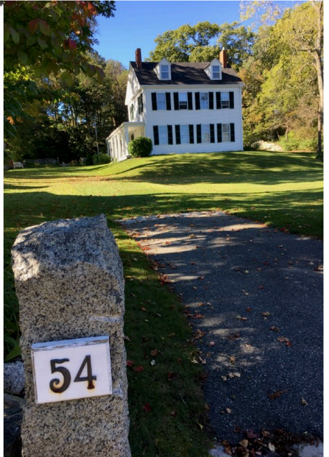
54 Leonard Street. Bobby and Teddy played football here on the lawn.