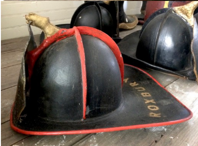
Rita Teele took these photos and passed them along as a sample of one of Don Usher's interests. The helmets are on display in the Firehouse.